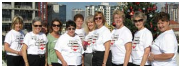
RMH staff celebrates the "topping off" at the new All Children's Hospital, future home of our fourth Ronald McDonald House.